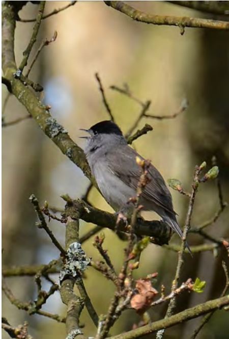
Male Blackcap singing

Blackcap ( Sylvia atricapilla ) R Several males singing in scrubby areas in Banstead Wood and adjacent shaws/scrub. Increasingly over-wintering.