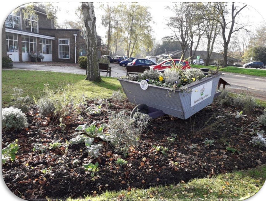
Figure 5 - Banstead Library Flower Beds