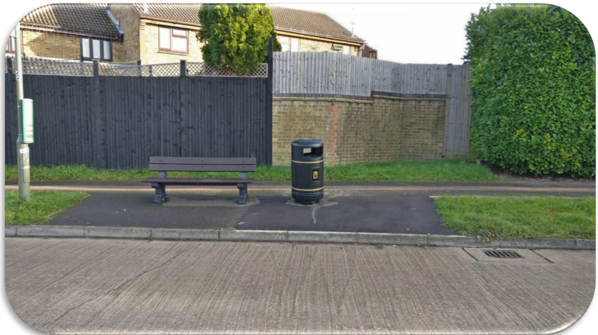
Figure 3 – New bench for the Waterfield Way bus stop close to Tulyar Close, Tadworth