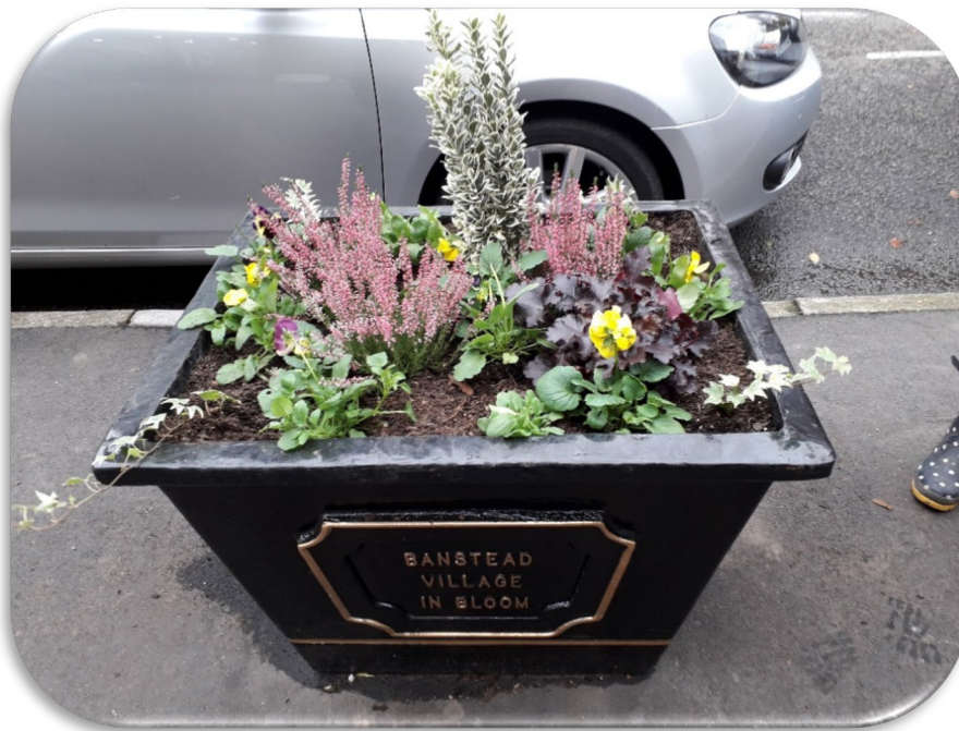
Figure 6 - Banstead High Street planters