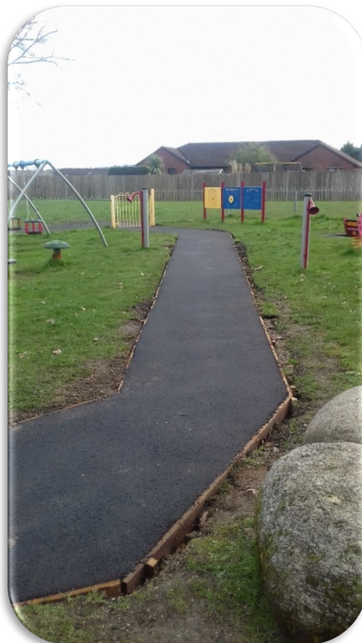
Figure 7 – The resurfaced footpath leading to and within Green Lane Playground, Redhill