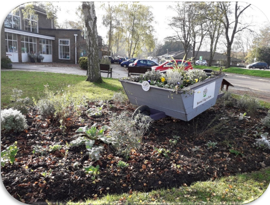
Figure 5 - Banstead Library Flower Beds