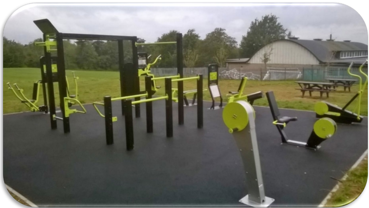
Figure 2 - Nork Park outdoor gym