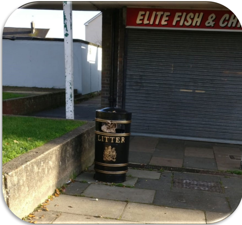
Figure 4 – Three new cast iron litter bins installed to replace the worn old plastic bins in front of Marbles way shops, Tadworth