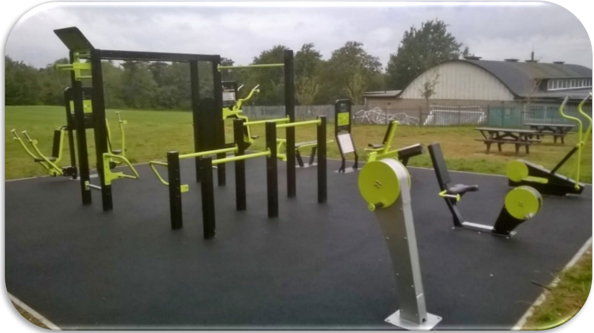
Figure 2 - Nork Park outdoor gym