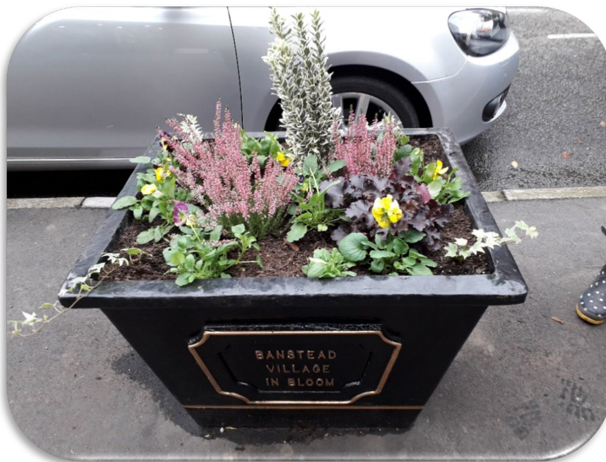
Figure 6 - Banstead High Street planters