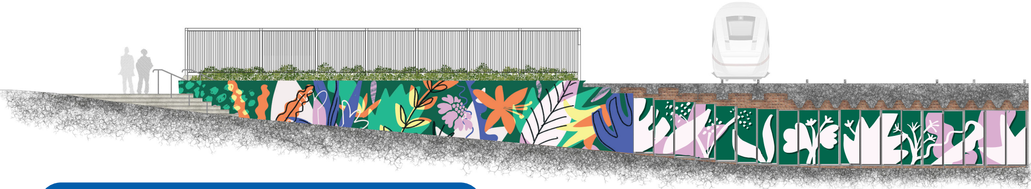
Artists impression of Theme 1