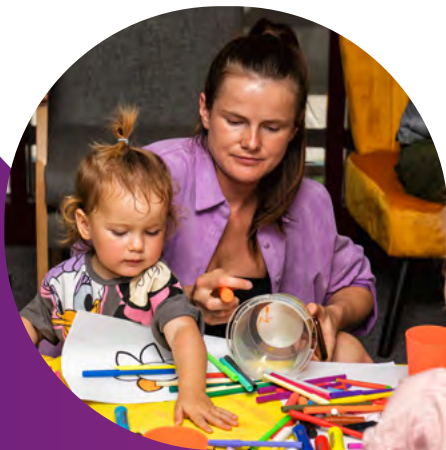
Enjoying a 'Stay & Play' session at the Woodhatch Community Centre

Our community centres at Banstead, Horley and Woodhatch are at the heart of their local communities and offer something for all ages to enjoy. You can relax with friends over a coffee, keep fit, get creative, access support, or volunteer your time – so pop along to see what's going on and have a free hot drink on us!