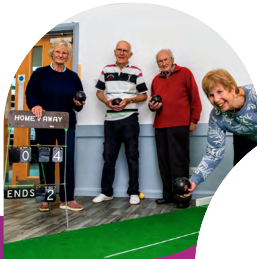
Indoor bowls is popular at all three community centres