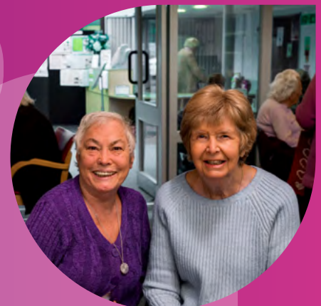
Catching up with friends at Banstead Community Centre

If you'd rather develop your creative talents with an art class or a singing group, or learn a new skill, there are plenty of friendly groups and classes to choose from and suggestions for new activities are always welcome. Sessions to help you get the most out of your computer, smartphone or tablet, already popular at Woodhatch, will be available at Banstead from December.