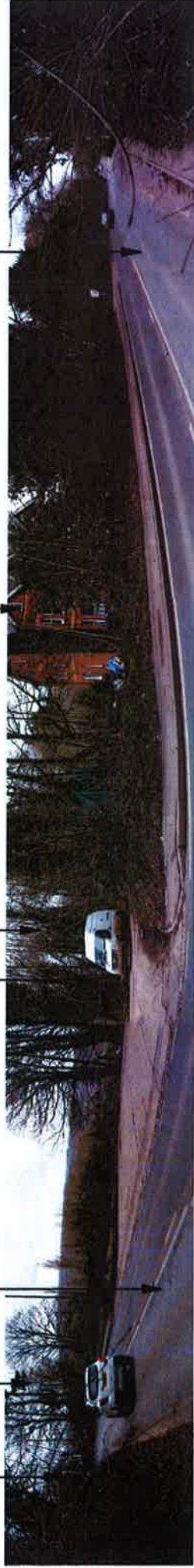
SITE CONTEXT PHOTOGRAPH 1: VIEW FROM A25 NUTFIELD ROAD, IN VICINITY OF 'BRAMPTON', LOOKING NORTH