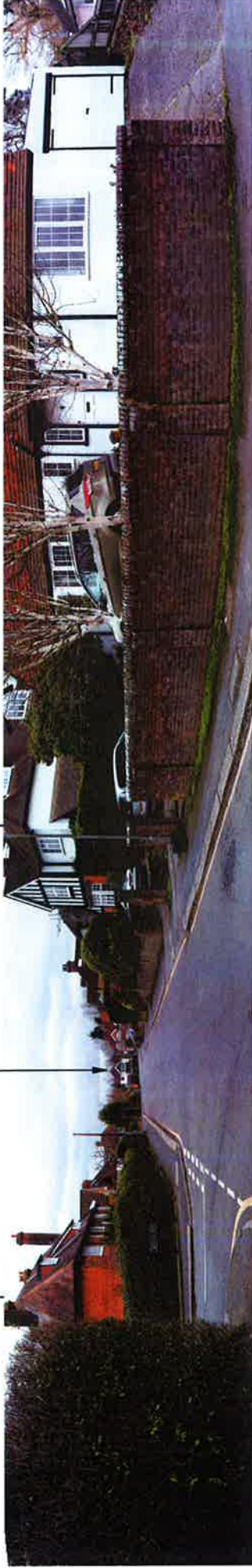
SITE CONTEXT PHOTOGRAPH 6: VIEW FROM HILLFIELD ROAD, LOOKING EAST