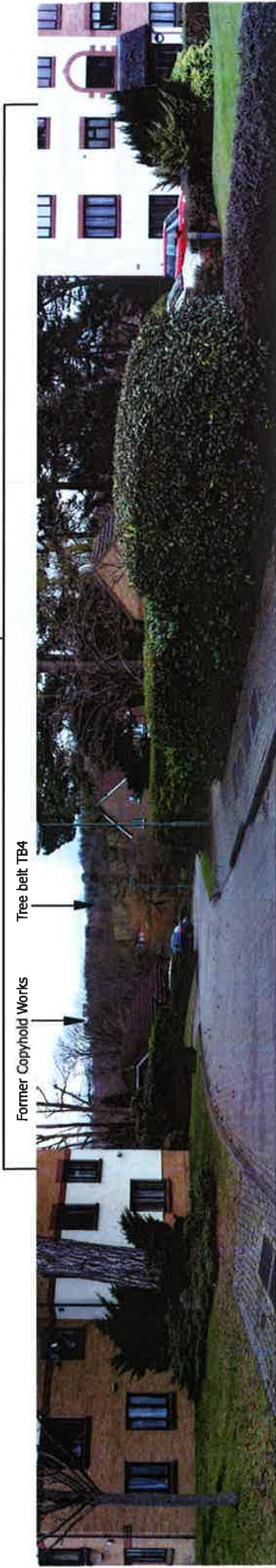
SITE CONTEXT PHOTOGRAPH 9: VIEW FROM ST ANNE'S RISE, LOOKING SOUTH