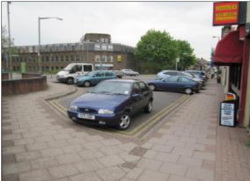
Figure 4: Site of proposed new civic space Horley Town Centre

Works are currently in progress as part of a scheme to provide a new public space outside the Jack Fairman public house, in Victoria Road, Horley. This will include the removal of parking, the laying of new surfacing and the installation of street furniture. The new space will seek to provide an identifiable gateway to the Town Centre and an area to meet, sit and relax as well as improved access to key facilities, businesses and shops.