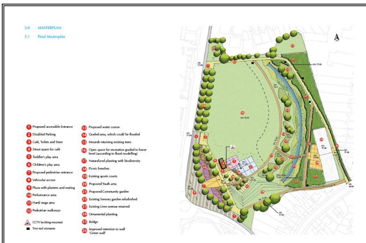
Figure 1: Memorial Park Proposals

Work carried out so far on the Redhill Town Centre Area Action Plan has identified opportunities for new and improved civic spaces within Redhill Town Centre. Improvements to the public realm are proposed for the north end of Station Road, adjacent to Queensway. These improvements are to be funded by S106 contribution (£250k index linked) from Hollybrook Homes related to their development of Nobel House, overlooking the site. An outline design has been agreed by local members; however this requires further refinement to bring it within the budget. Subject to funding the scheme should be delivered by the end of 2011.