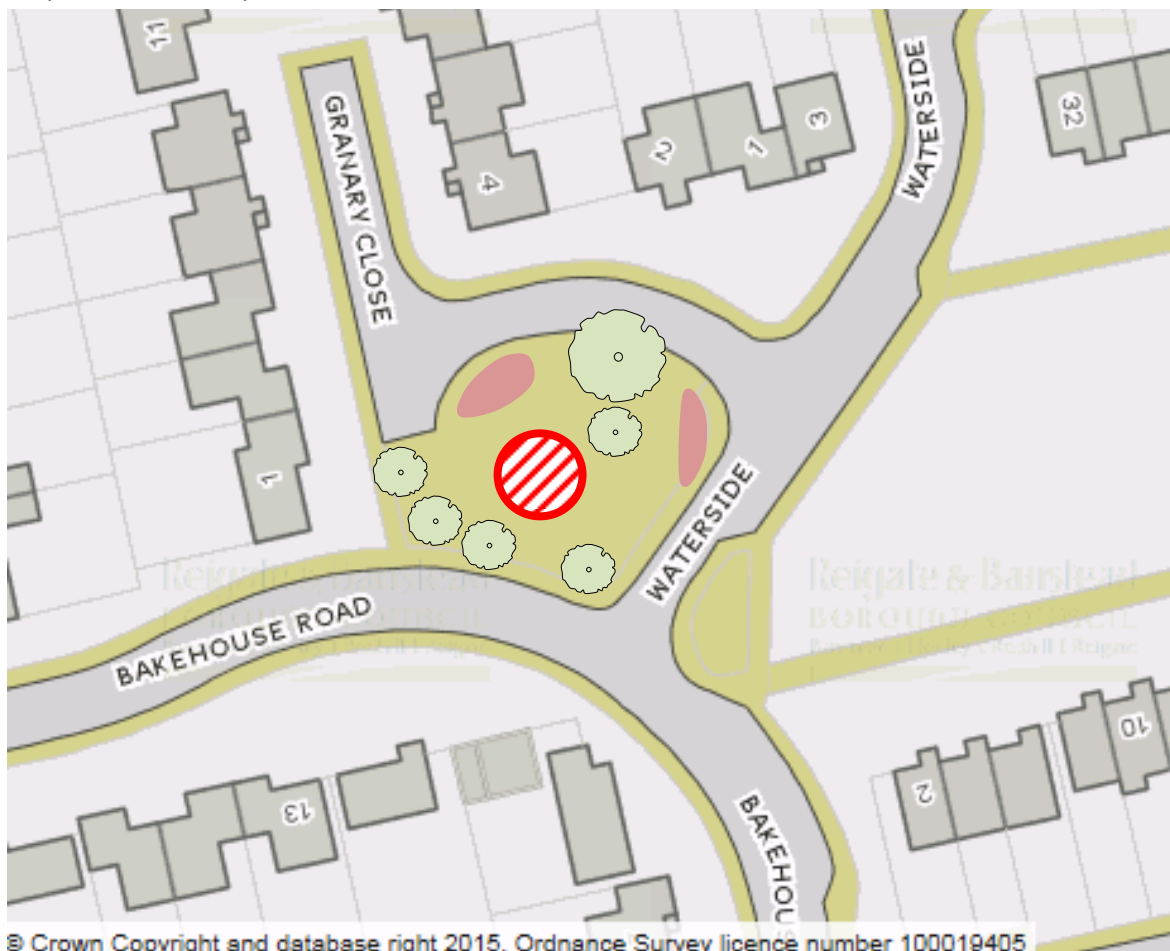
Map of site- Granary Close

Situated between Waterside, Granary Close and Bakehouse Road is a small island of grass containing a variation of shrubs and trees. Some of the shrubs are of poor specimen and have outgrown their surroundings and the trees consist predominantly of Ash and Oak. One of the Oak trees contained on the island is of particular interest owning many features defining it as a Veteran Oak. There is a schedule of planned work to remove the shrubs and crown lift some of the trees in order to tidy up the space and it has been suggested that the introduction of a wildflower bed would not only contribute to wildlife and ecosystems but help to preserve the quality of the area adding to its sense of character and visual appeal. It has been suggested that a mix consisting of Oxeye daisy and Poppy would be in fitting with the formality of the area retaining a natural feel to the island and wild rose beds created, providing cover/hedging and as a nectar source for pollinators. Note -Flower bed is 3m circumference from the wildflower sign in middle of site.