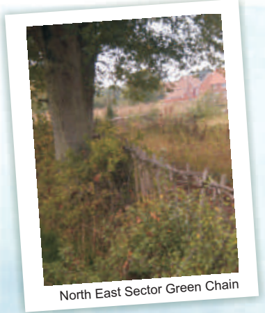
North East Sector Green Chain