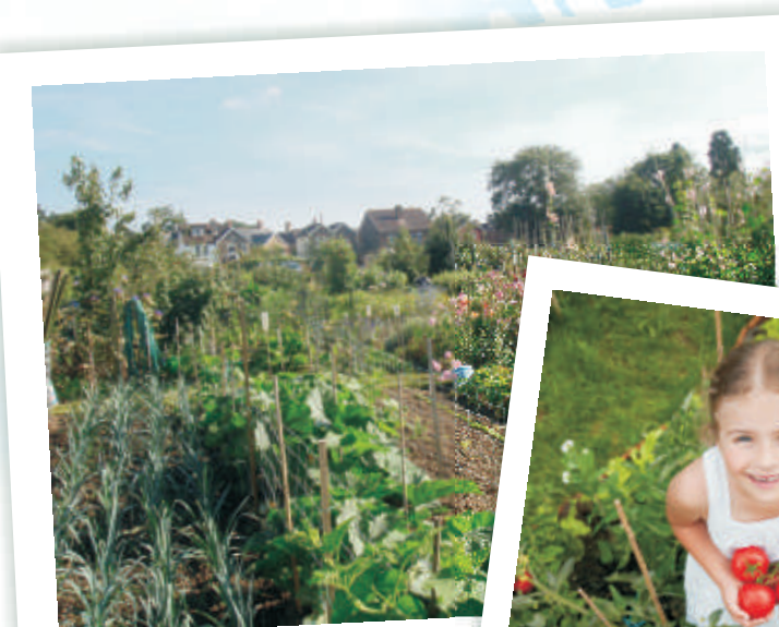
Church Road allotments