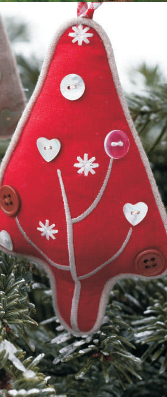
Decoration by Retreat