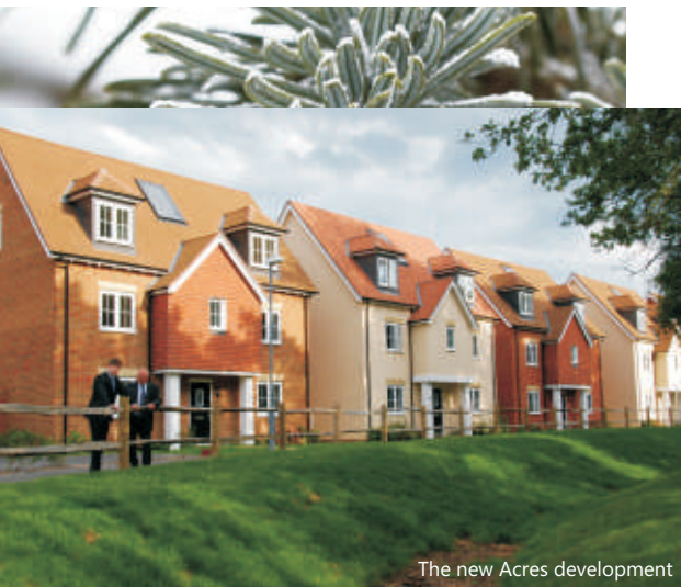
The new Acres development

For more information about The Acres, visit www.barratthomes.co.uk/theacres