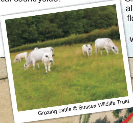
Grazing cattle

A small number of carefully selected docile breeds will be used to graze parts of the Green Chain, such