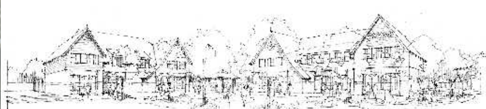
Neighbourhood Centre looking North-west

Let us know what you think about any of the articles you've read!