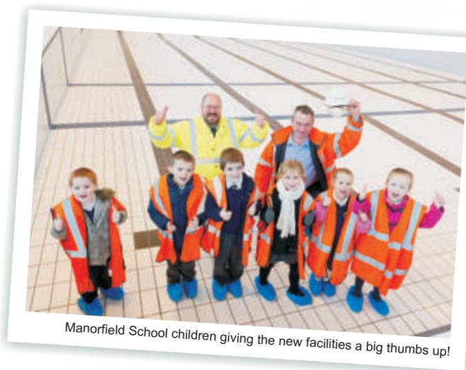
Manorfield School children giving the new facilities a big thumbs up!