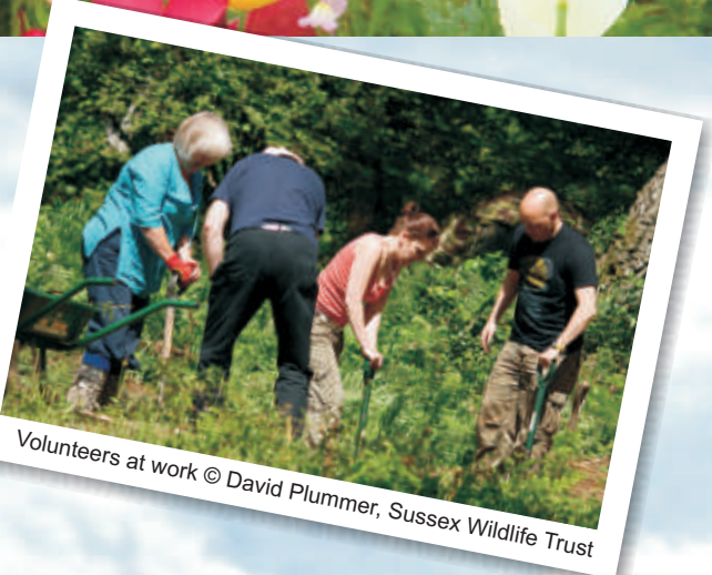
Volunteers at work