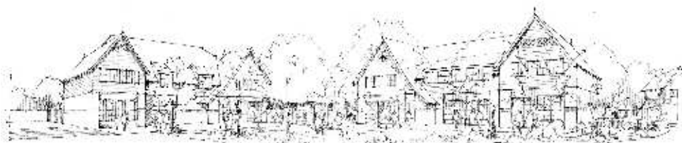
Neighbourhood Centre looking North-west

The school, which is a short distance from the Acres, is attended by many of the pupils that live at the development.