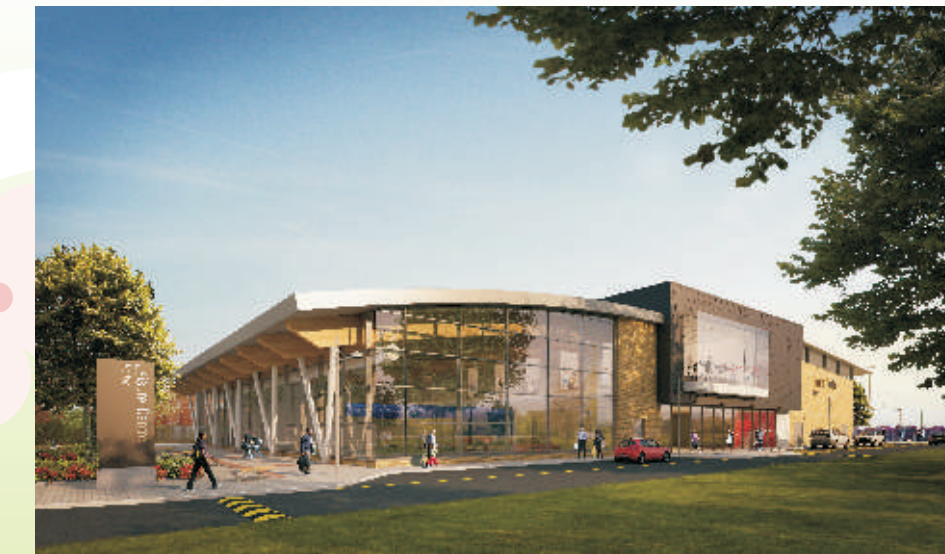
Image of the new Horley Leisure Centre

Design by MAD Ideas® 01293 773085 www.madideas.com