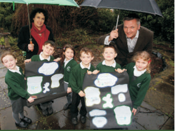
Barratt Southern Counties staff with Meath Green Infant School pupils