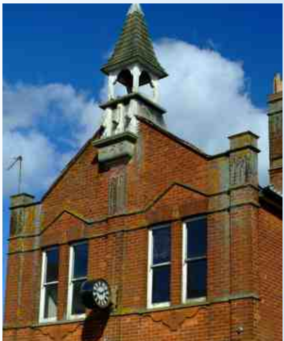
The Old Fire Station