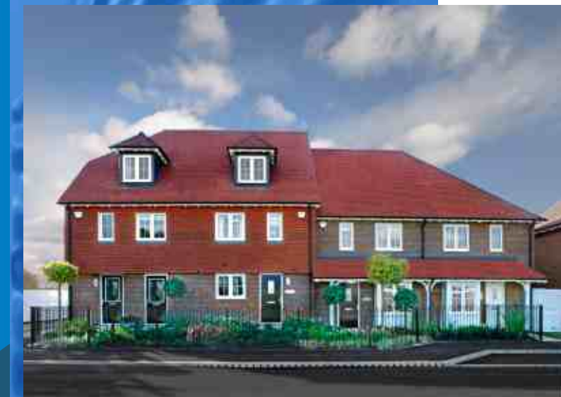
The three and four-bedroom showhomes at The Acres