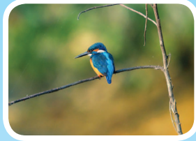
Kingfisher & Greater Spotted Woodpecker

Priory Park is home to 13 bird species of national conservation concern: Linnet, Song Thrush, Starling, Mute Swan, Kestrel, Kingfisher, Stock Dove, Cuckoo, House Martin, Green Woodpecker, Dunnock, Willow Warbler and Goldcrest.