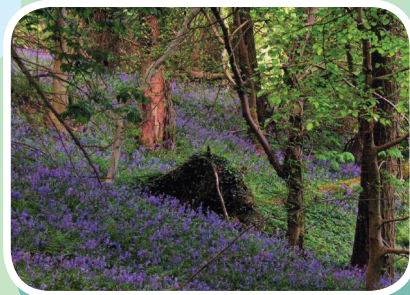
Bluebells in woodland

Over 207 types of plant species have been recorded on the site. Of general interest but also of botanical importance are the bluebells, which bloom in the woods each April/ May.