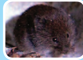
Roe Deer & Field Vole

In previous surveys six mammals have been found in the Park: fox, roe deer, mole, grey squirrel, field vole, and rabbit. Although smaller mammals such as mice and shrews are also likely to be present.