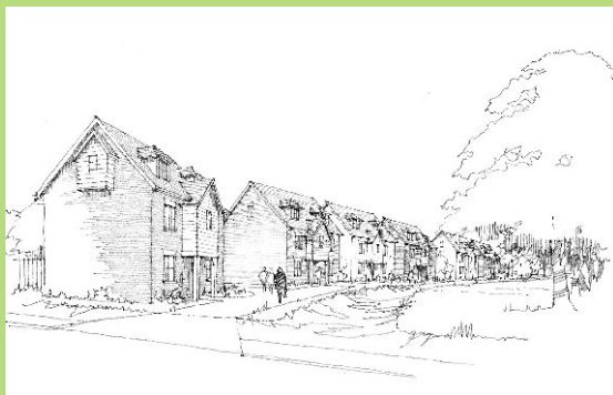
Artist's impression of the new housing

Barratt Wates and its contractor J Breheny are committed to responsible development in Horley. J Breheny is a member of the Considerate Contractors Scheme and will only work on site between 8am-6pm Monday to Friday and 8am-1pm on Saturdays. No work will be scheduled on Sundays or bank holidays.