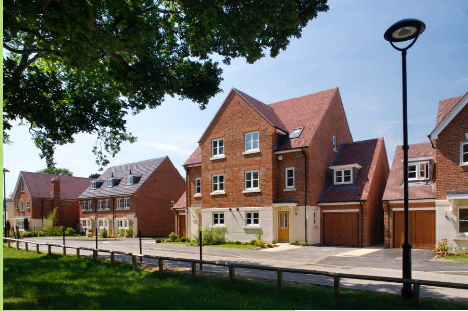
Housing style similar to the North East Horley development

The need for new housing in the South East is well established. We don't have enough homes for local people or for those looking to move to the area. This lack of accommodation is a potential obstacle to the area's economic growth.