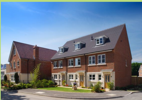
Housing styles similar to the North East Horley development