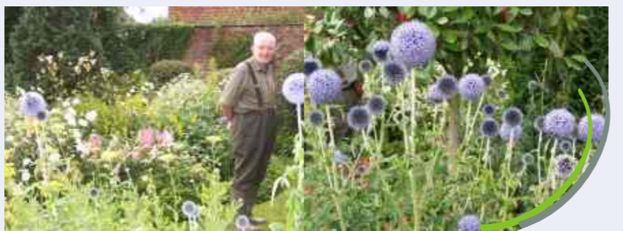
For Sponsors and Winners see: www.horleysurrey-tc.gov.uk