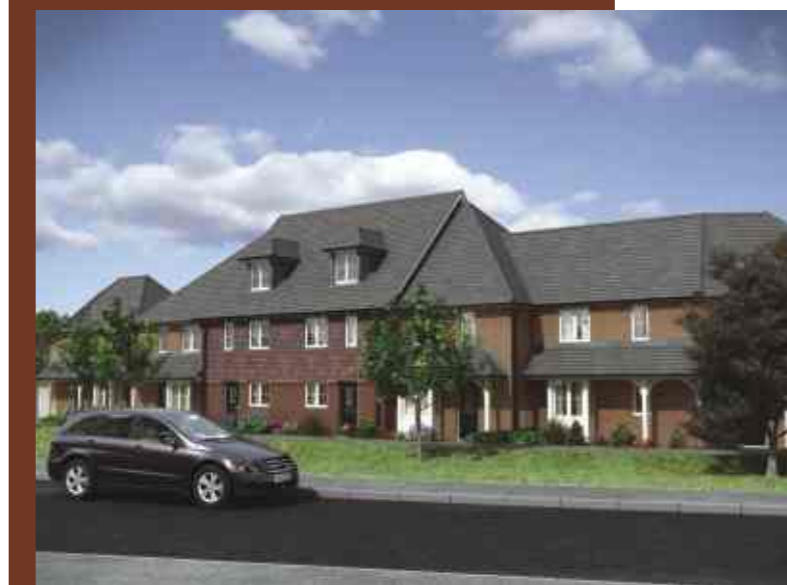
Artist's impression of the Acres

Showhomes are now open, enabling you to view the standard and variety of housing on offer for the first time. Visit the on-site marketing suite to discuss purchase options, layouts and even furnishing choices. There will be three detached houses to view, offering three, four and five bedrooms respectively; all fitted with modern appliances.