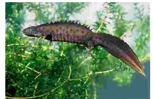
Photo: Great Crested Newt

There will be a mixture of housing types including houses, flats and affordable homes. The new dwellings will respect the local character of the area by using materials in keeping with other homes, such as hanging tiles, weatherboarding and chimneys.