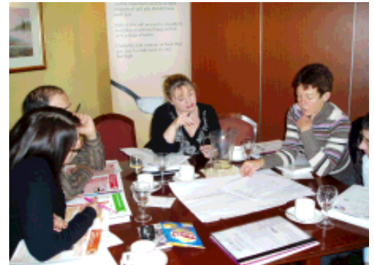
Attendees working through a practical exercise at one of the seminars