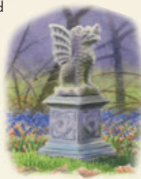
There be dragons at Upper Gatton Park...

9 Turn right onto the public bridleway and through a field. Before you reach the wood at the other side, turn left and follow the field edge (with the woodland on your right). At the corner of the field, cross the stile and follow the path through Upper Gatton Wood. (This woodland is a sea of blue in the spring – the bluebells indicate that there has been woodland here for at least 400 years.) Keep following the path straight on; ignore a path off to your right and cross a stile out into a field beside an old air-raid shelter. Walk through the parkland, following the woodland edge, passing another old air-raid shelter on your left.