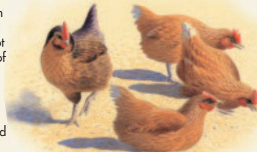
Chickens and cakes can be found at Fanny's Farm Shop

7 Turn right and follow the permissive path along the field edge (this is not a public right of way). Go through a gap in the hedgerow, cross a stile and follow the path between the fence and the hedgerow until you reach a gap in the hedge leading out onto Markedge Lane (so-called because it marks the parish boundary). Cross Markedge Lane and go straight on into the entrance to Fanny's Farm Shop.