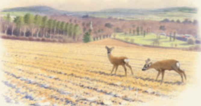
The view from Furze Field Shaw, at the top of Ashtead Hill

6 Cross the stile and follow the right hand field edge to a kissing gate. Go left then shortly right through another kissing gate and follow the path straight on with the hedge to your right. Go through another kissing gate and carry straight on until you come out into a large field with the M25 in front of you.